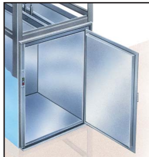
Hinged door option on 100kg Microlifts

The finish of the lift car and rise and fall shutters can be tough grey baked enamel or stainless steel.